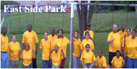
East Side Park