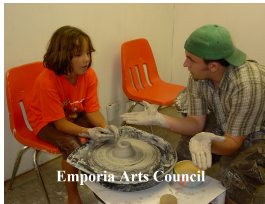
Emporia Arts Council