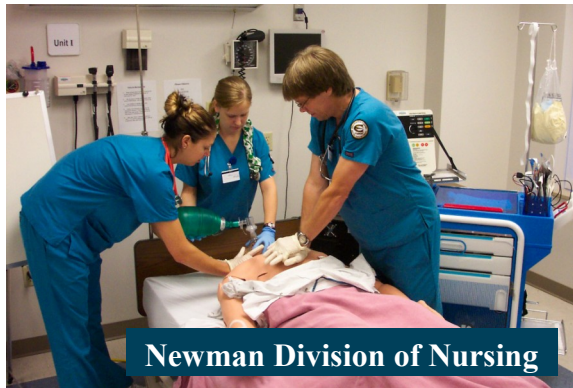
Newman Division of Nursing