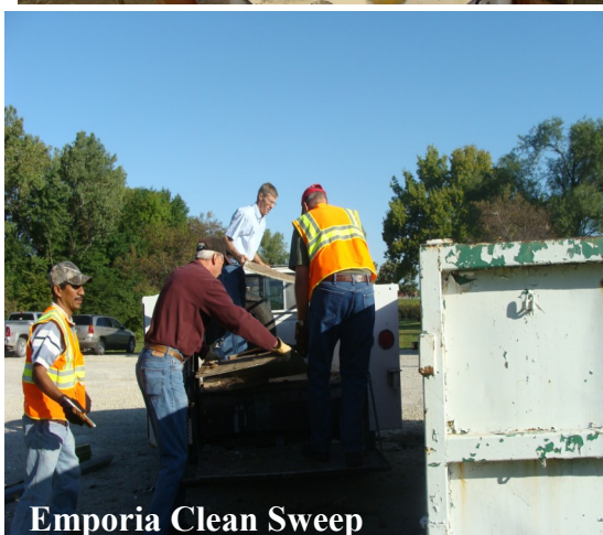
Emporia Clean Sweep