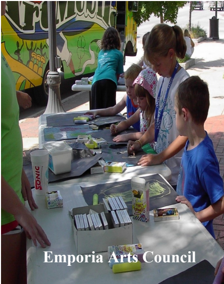
Emporia Arts Council