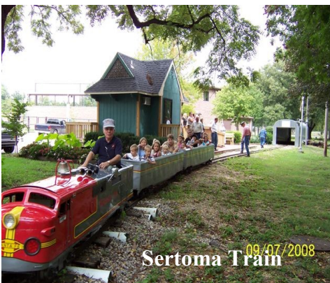
Sertoma Tram 09/07/2008