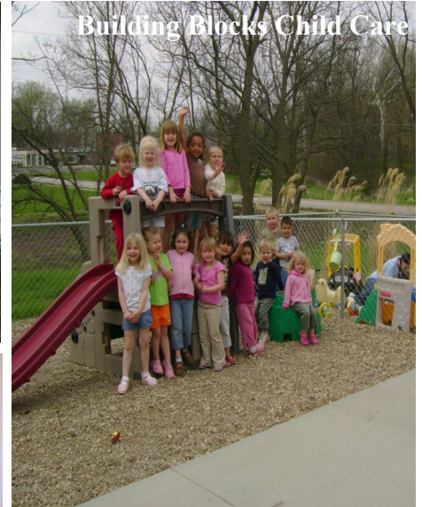
Building Blocks Child Care