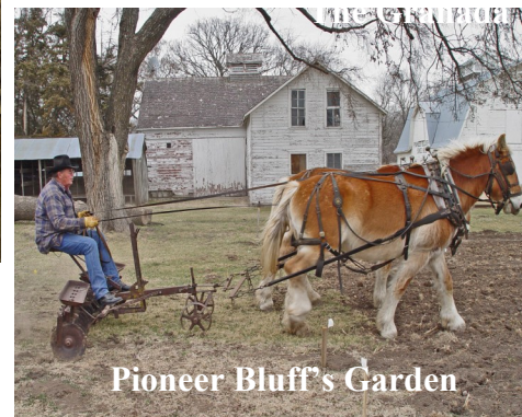
Pioneer Bluff's Garden