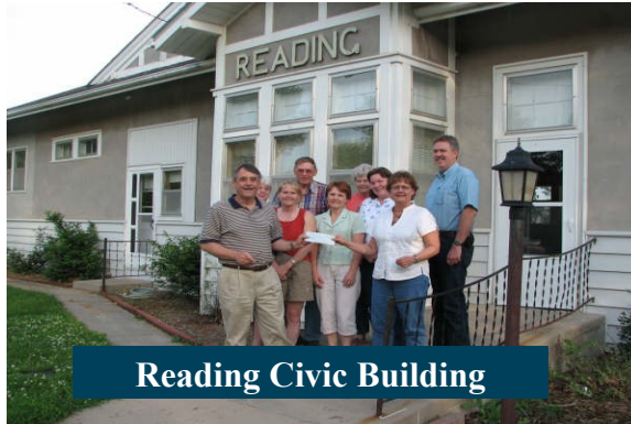
Reading Civic Building