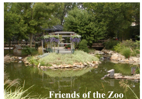
Friends of the Zoo