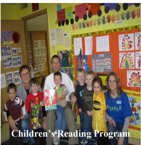
Children's Reading Program