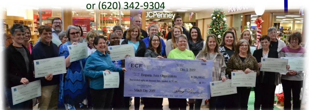
2019 Match Day Participants

Interested in becoming a sponsor? Contact Becky Nurnberg at <u>becky.nurnberg@emporiacf.org</u>